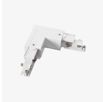
Right L-connector DALI Ref. 1.5000.8164