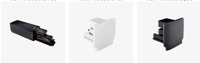
Right earth electrode DALI Ref. 1.5000.8261