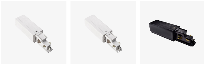
Left earth electrode DALI Ref. 1.5000.8160