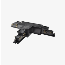
Left T-connector L2 & R2 DALI Ref. 1.5000.8272