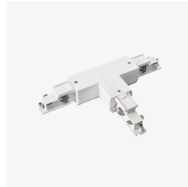
Right T-connector L2 & R2 DALI Ref. 1.5000.8173