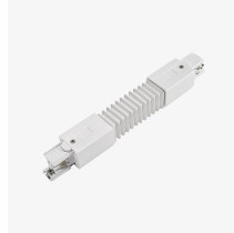
Flexible joint DALI Ref. 1.5000.8167