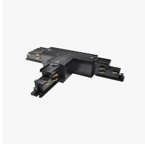
Right T-connector L2 & R2 DALI Ref. 1.5000.8273