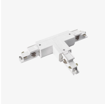
Left T-connector L1 & R1 DALI Ref. 1.5000.8170