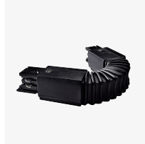
Flexible joint DALI Ref. 1.5000.8267