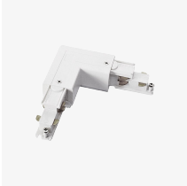
Left L-connector DALI Ref. 1.5000.8163