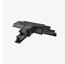
Left T-connector L1 & R1 DALI Ref. 1.5000.8270