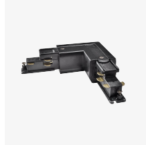
Left L-connector DALI Ref. 1.5000.8263