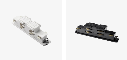
Straight joint DALI Ref. 1.5000.8166