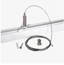
5m. suspension kit DALI Ref. 1.5000.8001