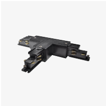
Right T-connector L1 & R1 DALI Ref. 1.5000.8271