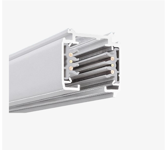
Straight joint DALI Ref. 1.5000.8266