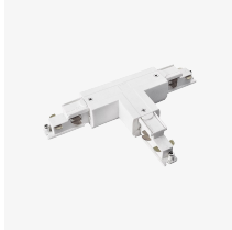
Right T-connector L1 & R1 DALI Ref. 1.5000.8171