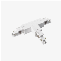
Left T-connector L2 & R2 DALI Ref. 1.5000.8172