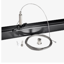
5m. suspension kit DALI Ref. 1.5000.8002