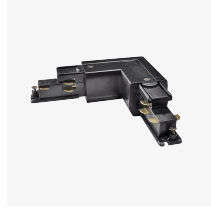
Right L-connector DALI Ref. 1.5000.8264